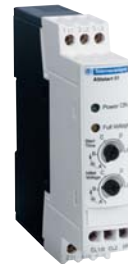
Altistart 01N1 from 3 to 25 A

For suppressing torque surges on starting (freewheel stop).