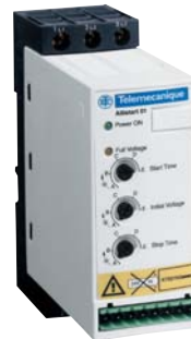
Altistart 01N2 from 6 to 85 A